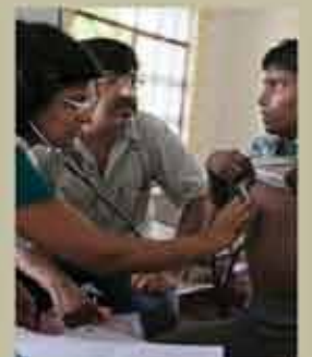
MEDICAL AID / COUNSELLING