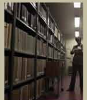
CEYLONESE ARCHIVE CENTRE