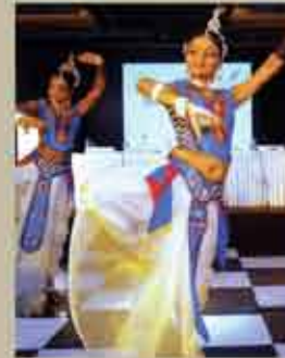
CULTURAL AND RELIGIOUS DEVELOPMENT