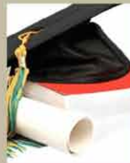
EDUCATION AND SKILLS DEVELOPMENT