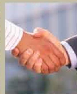
PROFESSIONAL ADVISORY SERVICES - LEGAL, TAXATION, BUSINESS ETC