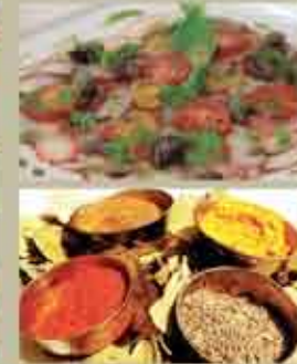
THE CUISINE AND CULINARY CONTINUITY