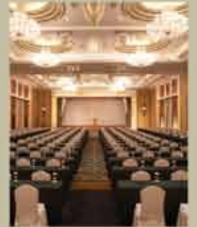
MEETINGS & OFFICIAL FUNCTIONS